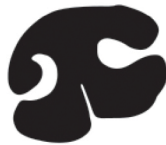
Custom Paw Print